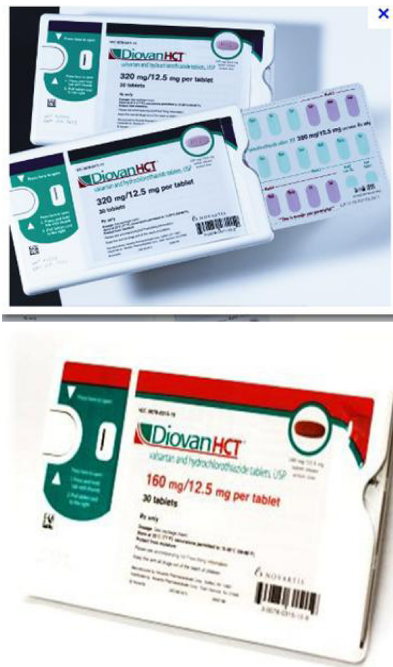
Figure 2 Reminder packaging dispensed to patients.

was provided on the cover for easy recognition. Instructions on how to open the RP were printed on the outside container cover. A reminder to reorder was found inside the blister card insert to prompt the reordering of refills by patients at the end of each monthly regimen.